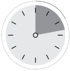
Initial 13 mins

Exams are designed to include sufficient time for setting up and presenting all sections, and overall durations are as follows: