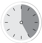
Grade 6 25 mins