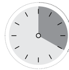
Grade 5 20 mins